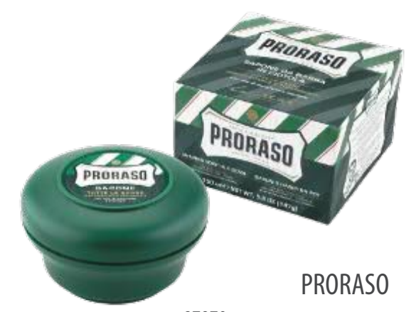
87970 high-quality shaving soap 150 ml (147 g) in a mug