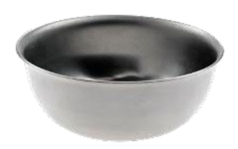
Shaving soap mug 87183 Ø 11 cm, height 4 cm, stainless steel/brushed