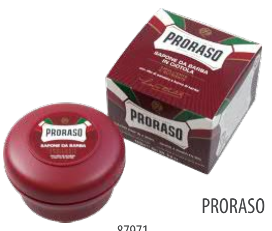
87971 high-quality shaving soap 150 ml (147 g) in a mug