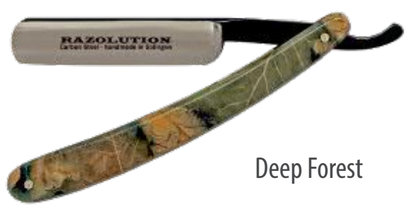
88103 5/8" carbon steel blade - burnished Made in Solingen