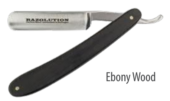
88152 5/8" carbon steel blade - polished/finely brushed Made in Solingen