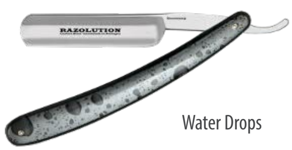
88105 5/8" carbon steel blade - polished/finely brushed Made in Solingen