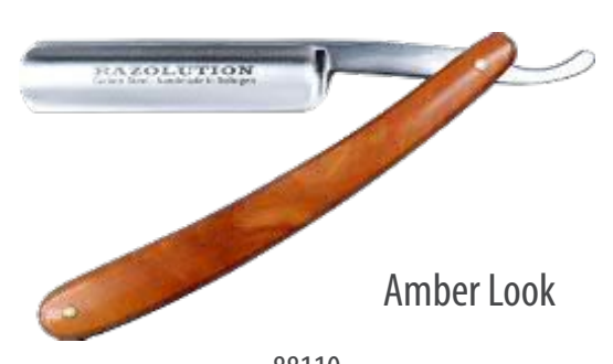
88110 5/8" carbon steel blade - polished/finely brushed Made in Solingen