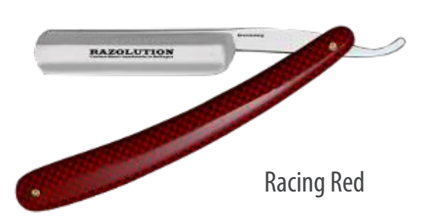
88109 5/8" carbon steel blade - polished/finely brushed Made in Solingen