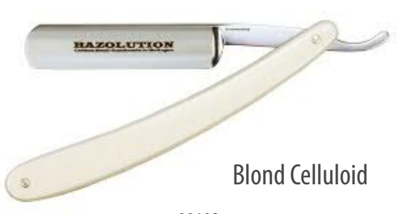
88102 5/8" carbon steel blade - polished/finely brushed Made in Solingen