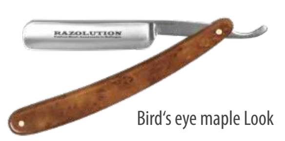
88112 5/8" carbon steel blade - polished/finely brushed Made in Solingen