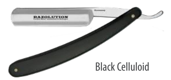
88101 5/8" carbon steel blade - polished/finely brushed Made in Solingen