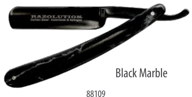
5/8" carbon steel blade - polished/finely brushed Made in Solingen