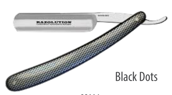
88114 5/8" carbon steel blade - polished/finely brushed Made in Solingen