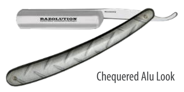
88104 5/8" carbon steel blade - polished/finely brushed Made in Solingen