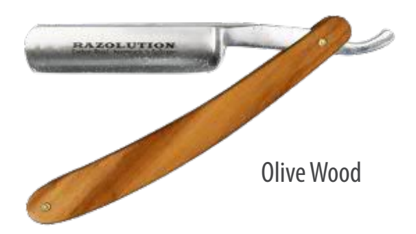
88150 5/8" carbon steel blade - polished/finely brushed Made in Solingen