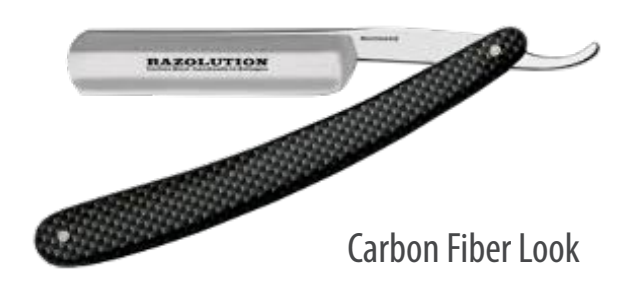
88107 5/8" carbon steel blade - polished/finely brushed Made in Solingen