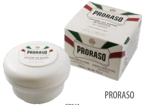
87961 high-quality shaving soap 150 ml (147 g) in a mug