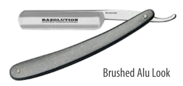
88106 5/8" carbon steel blade - polished/finely brushed Made in Solingen