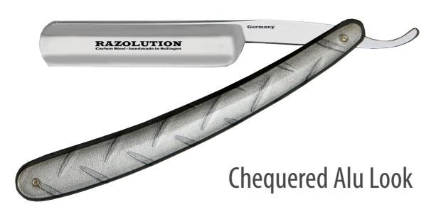
88104 5/8" carbon steel blade - polished/finely brushed Made in Solingen