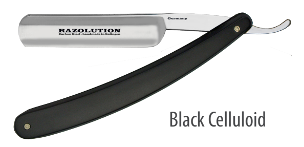
88101 5/8" carbon steel blade - polished/finely brushed Made in Solingen