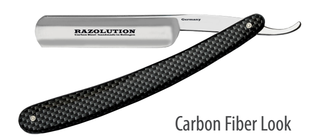
88107 5/8" carbon steel blade - polished/finely brushed Made in Solingen