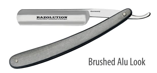
88106 5/8" carbon steel blade - polished/finely brushed Made in Solingen