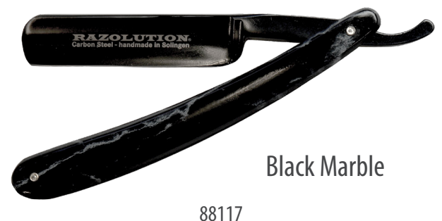
5/8" carbon steel blade - polished/finely brushed Made in Solingen