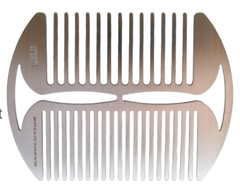
Beard comb 87180 Beard comb in credit card format