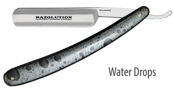
88105 5/8" carbon steel blade - polished/finely brushed Made in Solingen