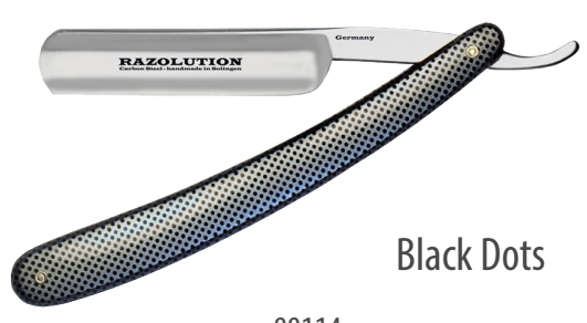
88114 5/8" carbon steel blade - polished/finely brushed Made in Solingen