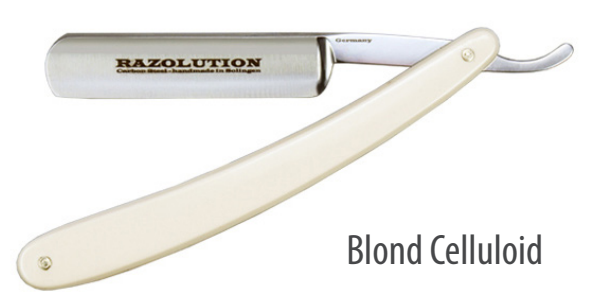
88102 5/8" carbon steel blade - polished/finely brushed Made in Solingen