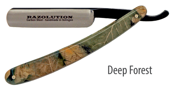
88103 5/8" carbon steel blade - burnished Made in Solingen