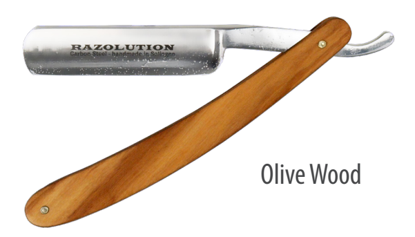
88150 5/8" carbon steel blade - polished/finely brushed Made in Solingen