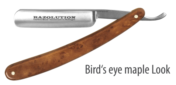
88112 5/8" carbon steel blade - polished/finely brushed Made in Solingen