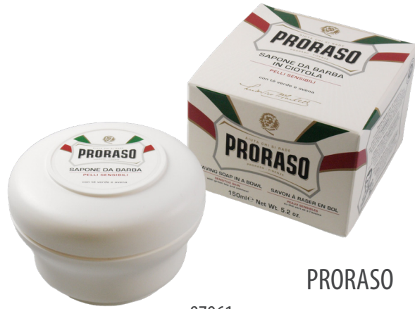
87961 high-quality shaving soap 150 ml (147 g) in a mug