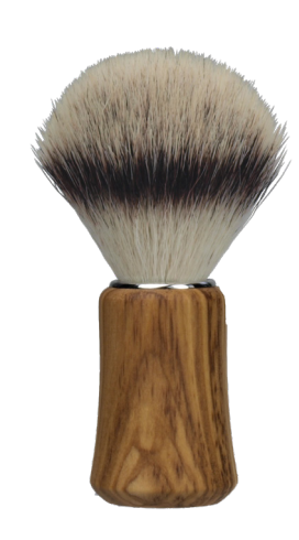
Shaving brush 86233 Shaving brush with synthetic hair hair length 50 mm Olive wood handle 50 mm with chrome-plated hair trim modern form