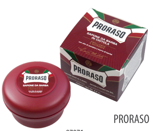
87971 high-quality shaving soap 150 ml (147 g) in a mug