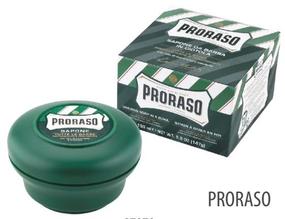
87970 high-quality shaving soap 150 ml (147 g) in a mug