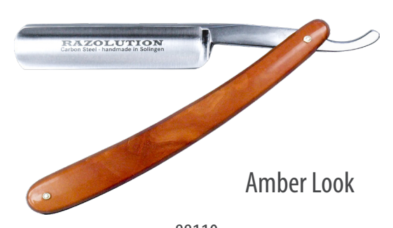
88110 5/8" carbon steel blade - polished/finely brushed Made in Solingen