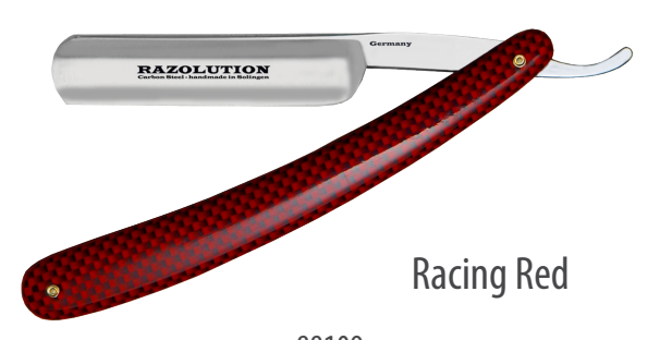
88109 5/8" carbon steel blade - polished/finely brushed Made in Solingen