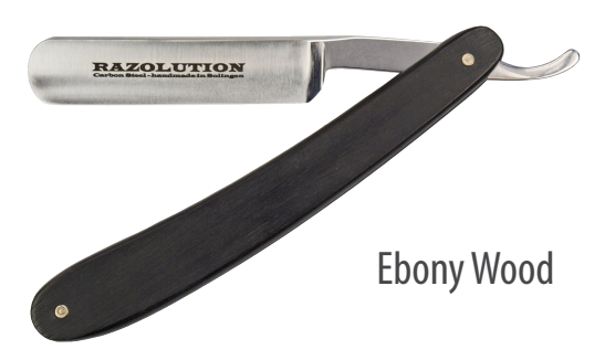
88152 5/8" carbon steel blade - polished/finely brushed Made in Solingen