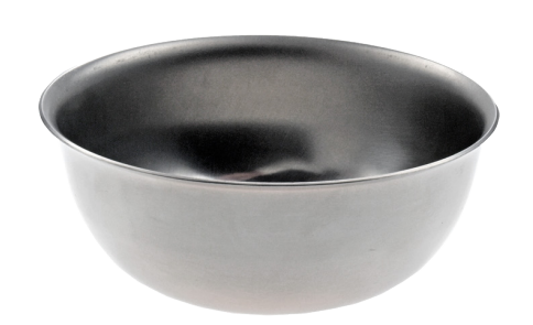
Shaving soap mug 87183 Ø 11 cm, height 4 cm, stainless steel/brushed